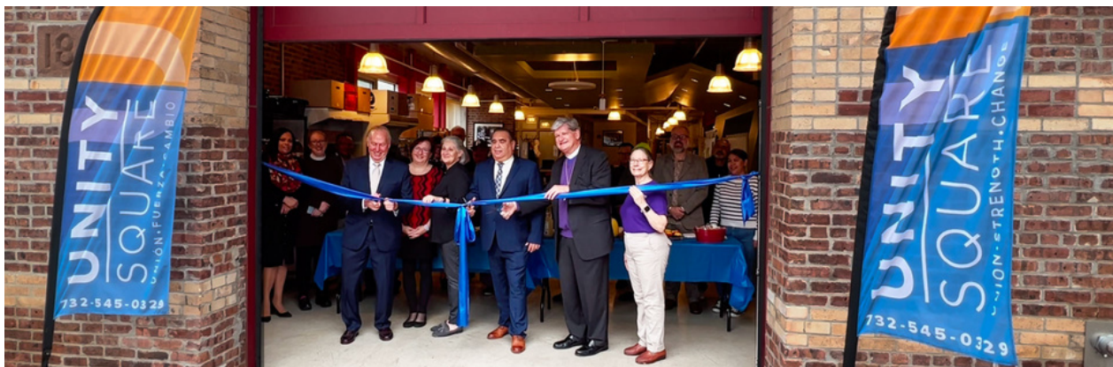
Ribbon-cutting for the ECS-funded Unity Square Choice Food and Resource Center in New Brunswick

The ECS Sunday Collect – by the Reverend Andrew D. Kruger