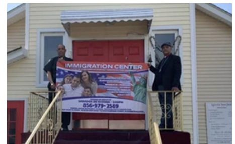
Promoting the ECS-funded immigration clinic at St. John/San José in Elizabeth.