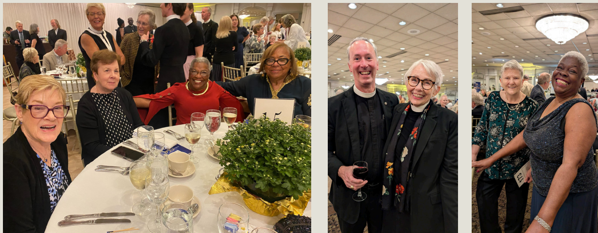
Smiles around the table, joy in the room, and hearts united for a greater purpose.